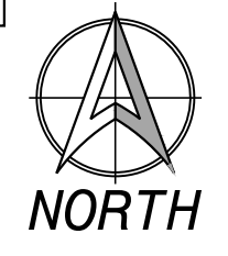
PATIO SITE PLAN SCALE: 1/4" = 1'-0"

NOTE: THIS SITE PLAN IS DIAGRAMMATICAL AND SHALL NOT BE CONSTRUED AS AN ACTUAL SURVEY. DIMENSIONS ARE APPROXIMATE.